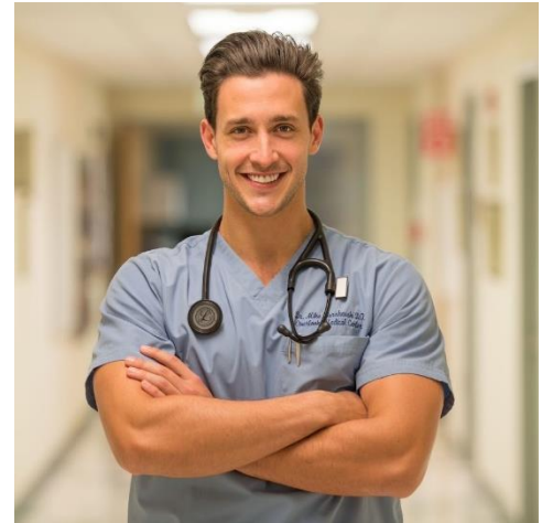
Keynote speaker at the 2022 International Leadership Conference, Dr. Mike Varshavski