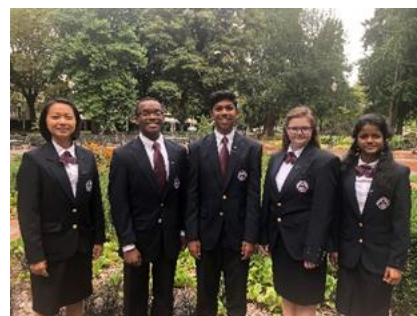
2019-2020 OR HOSA State Officer Team

The Oregon HOSA State Officer Program provides tremendous opportunities for students to gain new leadership skills, learn critical thinking, improve their planning and organization skills, become stronger speakers, demonstrate initiative, and much more. In short, it is a unique and valuable experience that Oregon HOSA is excited to make available to its members.