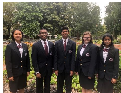
2019-2020 OR HOSA State Officer Team

The Oregon HOSA State Officer Program provides tremendous opportunities for students to gain new leadership skills, learn critical thinking, improve their planning and organization skills, become stronger speakers, demonstrate initiative, and much more. In short, it is a unique and valuable experience that Oregon HOSA is excited to make available to its members.