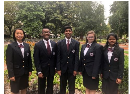
2019-2020 OR HOSA State Officer Team

The Oregon HOSA State Officer Program provides tremendous opportunities for students to gain new leadership skills, learn critical thinking, improve their planning and organization skills, become stronger speakers, demonstrate initiative, and much more. In short, it is a unique and valuable experience that Oregon HOSA is excited to make available to its members.