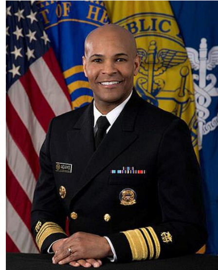
Keynote speaker at the International Leadership Conference, Dr. Jerome Adams.