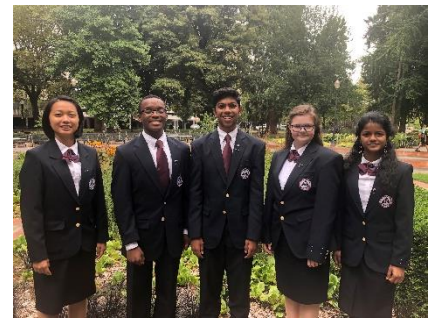
2019-2020 OR HOSA State Officer Team

The Oregon HOSA State Officer Program provides tremendous opportunities for students to gain new leadership skills, learn critical thinking, improve their planning and organization skills, become stronger speakers, demonstrate initiative, and much more. In short, it is a unique and valuable experience that Oregon HOSA is excited to make available to its members.