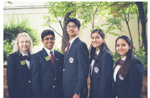
2018-2019 OR HOSA State Officer Team

The Oregon HOSA State Officer Program provides tremendous opportunities for students to gain new leadership skills, learn critical thinking, improve their planning and organization skills, become stronger speakers, demonstrate initiative, and much more. In short, it is a unique and valuable experience that Oregon HOSA is excited to make available to its members.